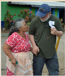
Ateos, El Salvador