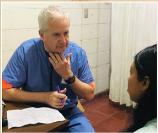
San Salvador, El Salvador