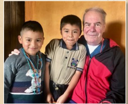
Santa Maria de Jesus, Guatemala