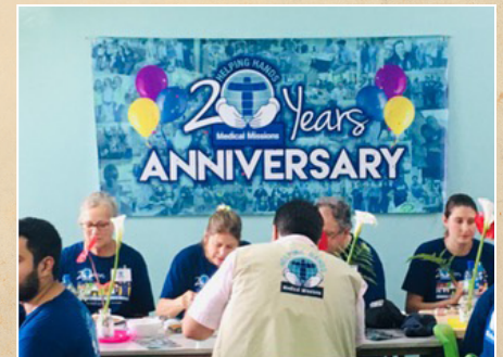
Santiago Texacuangos, El Salvador